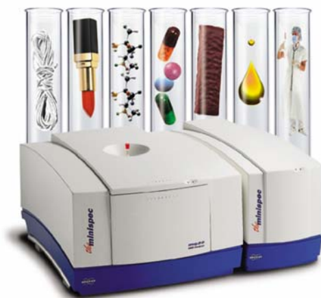
Figure 3. BRUKER minispec mq series (Bruker Optik GmbH, Germany)