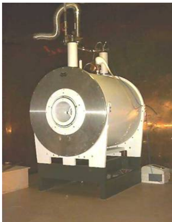
Figure 4. BRUKER Biospec 100MHz NMR imaging system