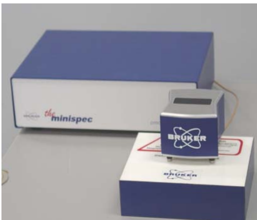
Figure 2. BRUKER Professional MOUSE (Bruker Optik GmbH, Germany)